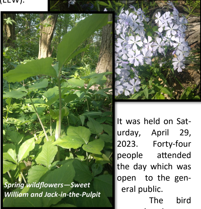
Spring wildflowers—Sweet William and Jack-in-the-Pulpit

This was the 44th year for Tri-Moraine Audubon's Environmental Education Weekend (EEW).