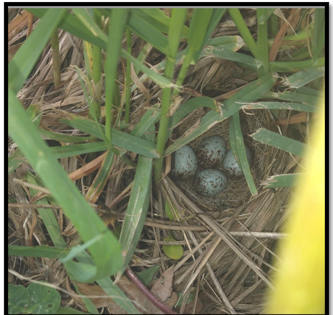
Field Sparrow nest with four eggs.

Watching our native birds go about their daily lives is a lesson in ornithology. Much can be learned by backyard observations. Keeping one's eyes on bird feeders, trees and shrubs, one can find some interesting behaviors. Bird watching is not just for the Important Bird Areas!