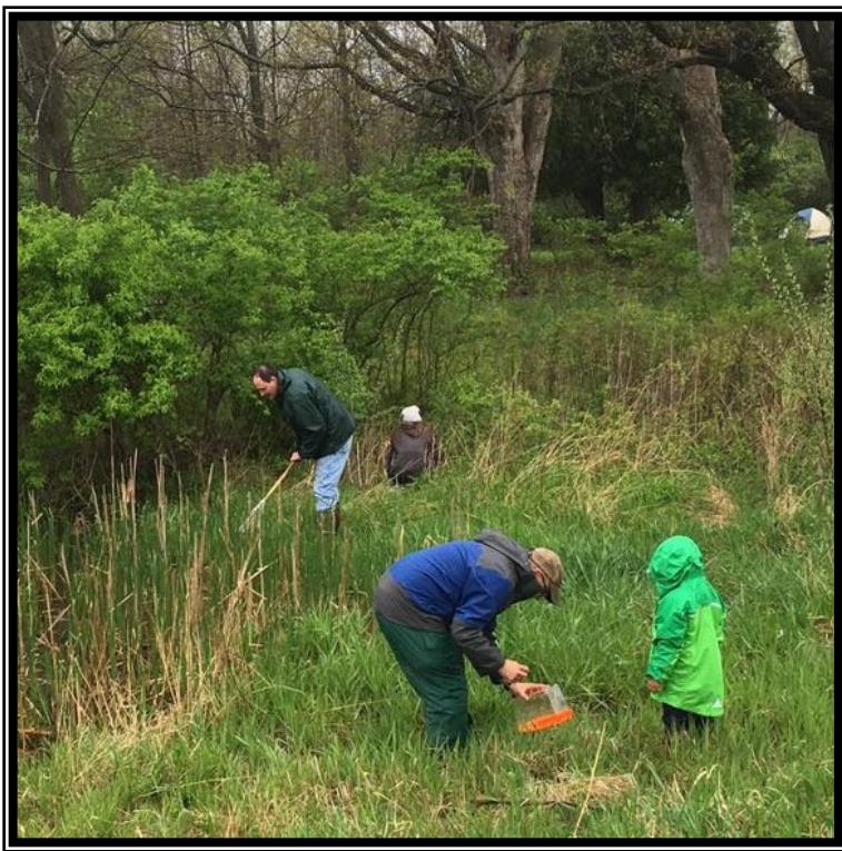
Finding insects at EEW Weekend from previous years.