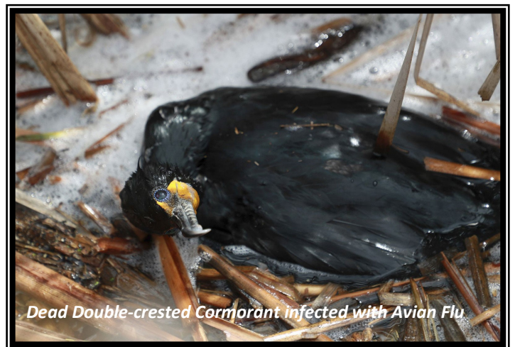
Dead Double-crested Cormorant infected with Avian Flu

At this point, guidance on whether the public should take down bird feeders has been mixed. While some groups such as The University of Minnesota's Raptor Center and Cornell Cooperative Extension are advising people to do so, others say cleaning bird feeders, gear, and baths regularly should suffice. The National Audubon Society currently recommends its members to follow the guidelines provided by local and state agencies. As spring migration ramps up, Hutchinson also urges birders visiting parks with waterfowl to disinfect their shoes afterward, which can help prevent transmitting the virus to unaffected areas."